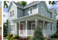
PASEO HOMES IVORY HOMES FROM THE HIGH $200'S

Homebase for neighborhood backyard barbecues and movie nights