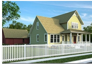
WATERSIDE MANOR HOLMES HOMES Deceptively spacious and meticulously detailed, your guests will never want to leave!