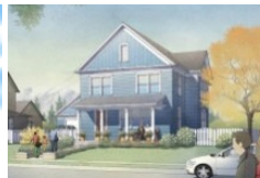
PREMIER DESTINATION HOMES FROM THE MID $300'S

Flexible Floor plans with homesites near a big park.