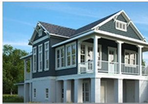
HILLSIDE PASEO HOLMES HOMES Groupings of homes located on a generous shared green space with spectacular views.

THE HOMES Our team of architects and homebuilders has created all-new home designs that take full advantage of two unique locations within the Lake Village: on a hillside overlooking the lake and on a peninsula surrounded by the lake. The homes are all about views, sunlight, cross breezes and seamless indoor-outdoor living.