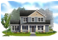
PEDIGREE COLLECTION DAVID WEEKLY HOMES FROM THE MID $300'S

Plans with intelligent use of space and cozy outdoor rooms.