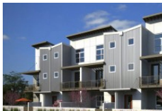
LIGHT HOUSE TOWNHOMES HOLMES HOMES FROM THE LOW $200'S

With all the Daybreak goodness you can squeeze between two creeks (one historic and one man-made), Creekside Village continues the rich traditions of inspired design that has made Daybreak Utah's favorite new home community. Homes are available in a variety of styles based on some of Salt Lake City's most beloved historic neighborhoods (with today's livability and energy efficiency). But what really sets it apart is what happens once you step out your front door. A 15-acre park, excellent schools, walking trails and community gatherings all add up to a different kind of life --one that feels more like living.