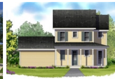
COTTAGE COURT HOMES DAVID WEEKLY HOMES FROM THE MID $200'S

A more traditional townhome with more generous spaces