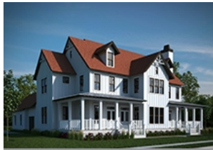
WATERSIDE ESTATES RAINEY HOMES Large outdoor patios that flow out from the scrumptious entertaining spaces inside