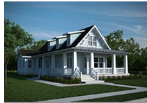
WATERSIDE COTTAGES RAINEY HOMES The quintessential beach cottage with a Daybreak twist, and all the trimmings Rainey Homes is known for.