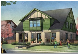
HILLSIDE MANOR COLLECTION DESTINATION HOMES Large porches, private courtyards, grand entrances and family size floor plans.