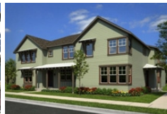
SHORELINE TOWNHOMES HOLMES HOMES FROM THE LOW $200'S

Funky urban style townhomes with a front courtyard