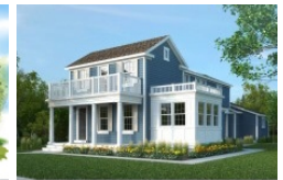
CLASSIC COLLECTION HOLMES HOMES FROM THE LOW $300'S

Don't let the name fool you, these single family homes live big