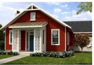
THE ESTATE HOMES Gracious living areas, full basements and generous outdoor living spaces.