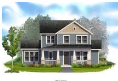
PEDIGREE COLLECTION DAVID WEEKLY HOMES FROM THE MID $300'S

Plans with intelligent use of space and cozy outdoor rooms.