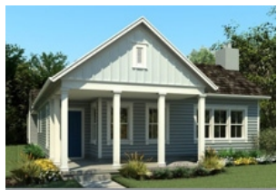
THE PATIO HOMES They come with porches, patios and a greater sense of privacy.