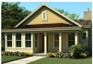
THE GARDEN HOMES Larger rooms, basements and the chance to have a backyard garden.