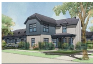
THE TOWN HOMES For those who want a bit more room but no extra yard work.