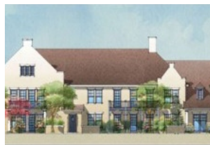
THE CONDOMINIUMS Right-sized homes with wide-open spaces inside and out.