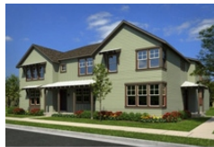
SHORELINE TOWNHOMES HOLMES HOMES FROM THE LOW $200'S

Funky urban style townhomes with a front courtyard