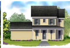
COTTAGE COURT HOMES DAVID WEEKLY HOMES FROM THE MID $200'S

A more traditional townhome with more generous spaces